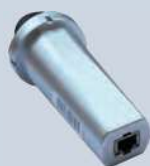
Data Logging Stick LAN