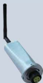
Data Logging Stick Wi-Fi