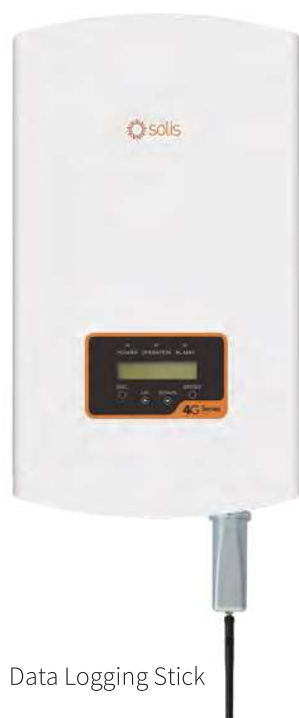
Data Logging Stick